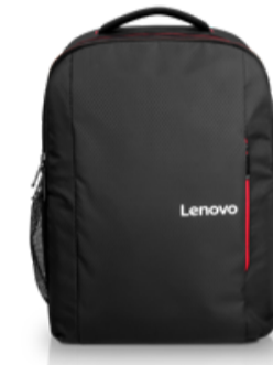
Lenovo 16" Laptop Everyday Backpack B510