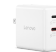
Lenovo Dual USB-C 65W GaN Charger