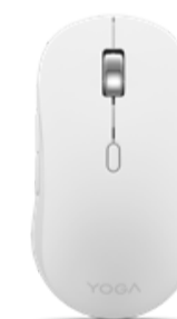
Lenovo Yoga Bluetooth Silent Mouse (Seashell, W/O Battery)