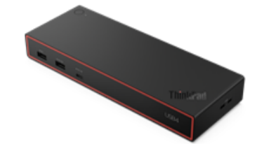
ThinkPad USB4 Dock 5000